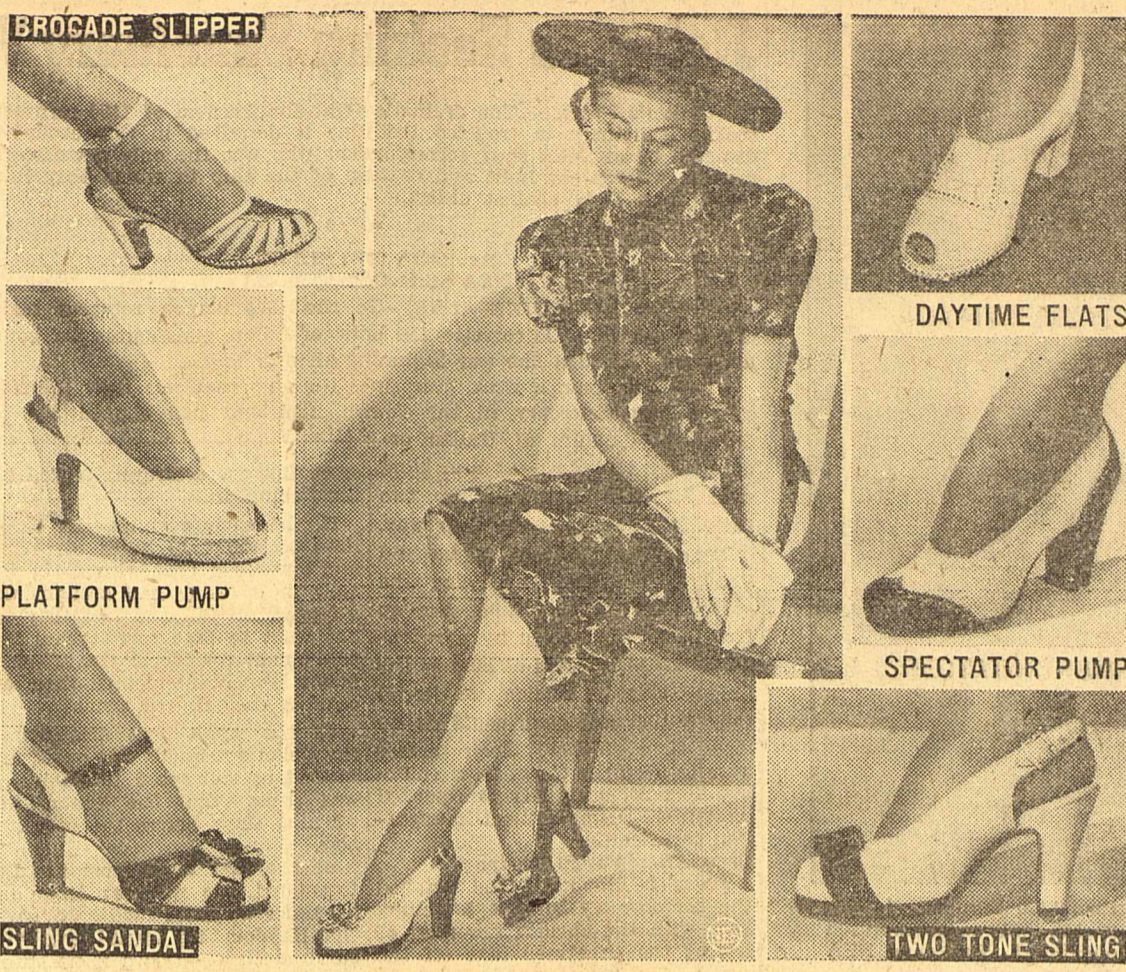
White kidskin, both suede and glaze, makes its first postwar appearance in summer shoes designed for wear around the clock. The shoes pictured above use white accented with colored leather, smoky reptile or gold nailheads.