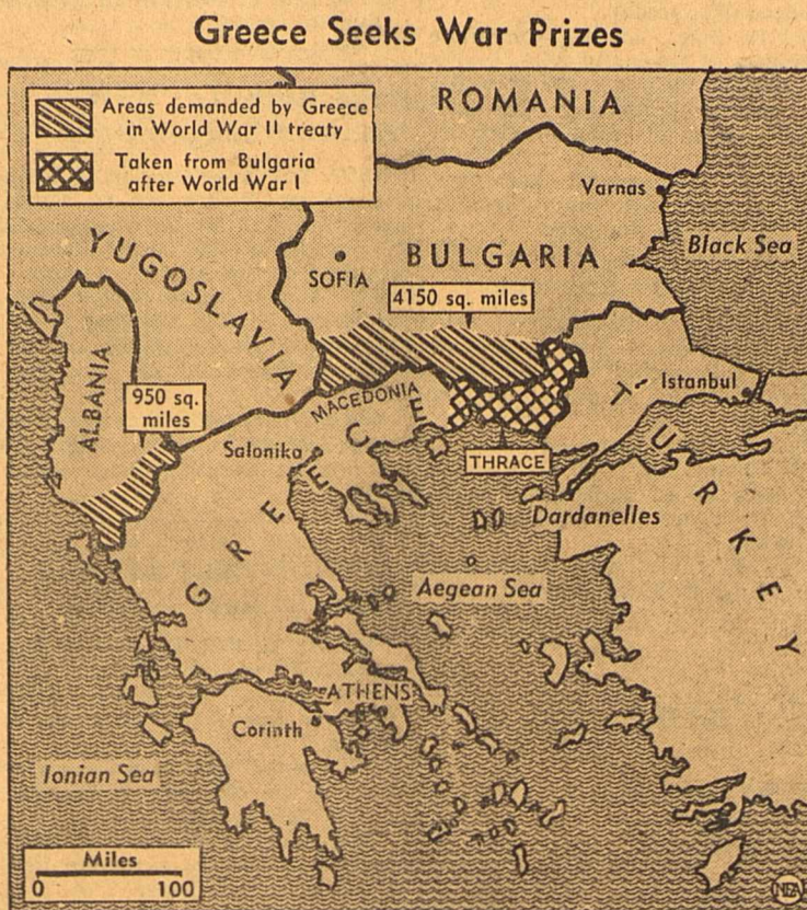
In a surprise demand on the eve of the Big Four foreign ministers' peace terms conference in Paris, Greece demanded the slices of Albania and Bulgaria indicated on map above. After the second Balkan War, 1913, Bulgaria got northeastern Macedonia and western Thrace. Greece regained Thrace after World War I.

BALTIMORE —(P)— An attempt to extort $15,000 from Screen Actress Dorothy Lamour was disclosed Wednesday by an official source shortly after recovery of jewelry and valuables stolen from the actress in a $29,000 theft last Thursday had been announced.