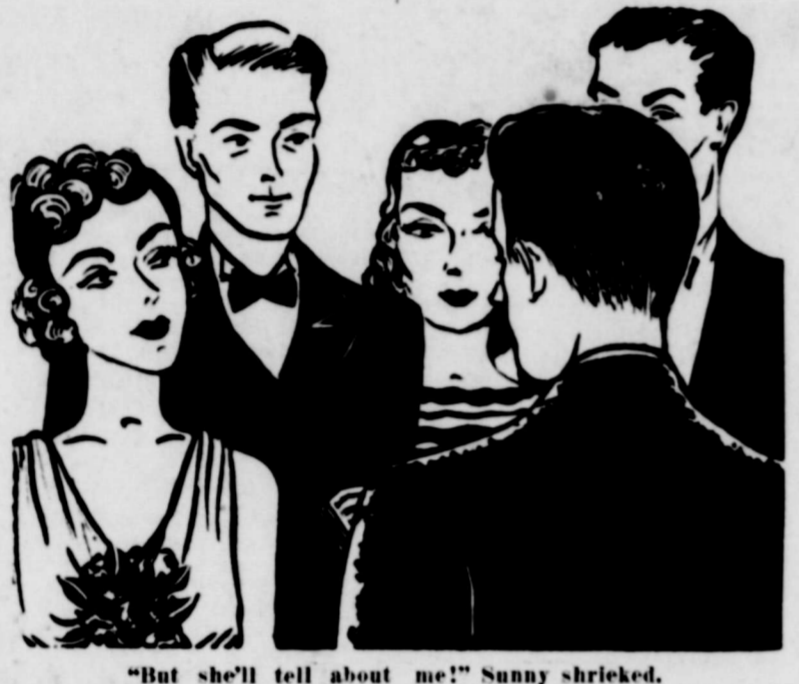
"But she'll tell about me!" Sunny shrieked.