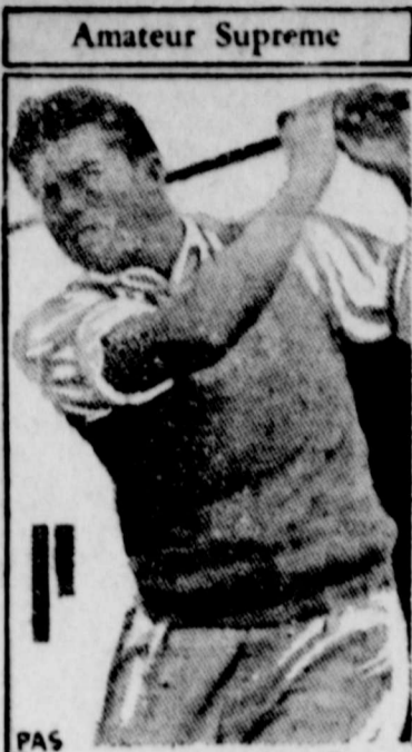
Amateur Supreme NEW YORK . . . Is Wm. Lawson Little, Jr., (above), of San Francisco on his way to set golfing records as impressive as those of Bobby Jones? The 24 year old American youth, in winning the British Amateur title for the second consecutive year, while holding the American title, is the third golfer ever to have won the British title two years in a row. If he repeats in the American championship play this year he will have one record bettering Jones.