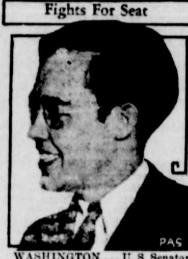
Fights For Seat WASHINGTON . . . U. S. Senator-elect Rush D. Holt (above), of West Virginia will be 30 years old on June 19th, at which time he hopes to be seated. He has occupied a seat during this session of congress but could not vote. If seated he will be the youngest U. S. Senator.