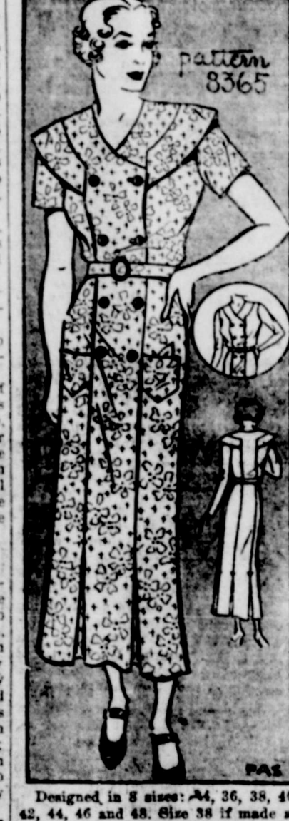
Designed in 5 sizes: 44, 36, 38, 40, 42, 44, 46 and 48. Size 38 if made as in the large view, will require 3 3/4 yards of 35 inch material. If made with long sleeves, 4 1/2 yards.

Rebuffed in her effort to gain an amateur standing in the game she took up only two years ago, Mildred (Babe) Didrikson, the girl wonder athlete from Texas, Saturday decided to market her 260-yard drives and personality on the fairways by turning golf professional.