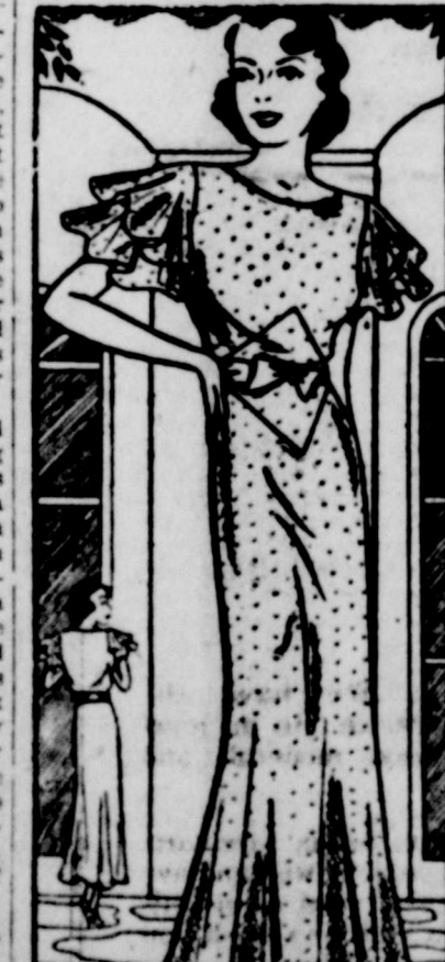
Designed in Sizes: 14, 16, 18, 20, 22, 24, 26, 28, 30, 32, 34, 36, 38, 40 and 42. Size 18 requires 4 yards of 39 inch material. Self of fabric requires 1 1/2 yds.