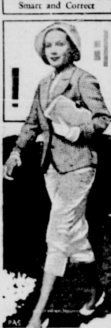
Smart and Correct LOS ANGELES . . . You won't go wrong, young lady, if in your summer wardrobe you have a smart flannel skirt, white or pastel shades; a checkered tailored sport jacket and a smart felt and auxiliary panama, and completed with the smartest of smart two-tone and matching sport shoes. . . . Dolores Del Rio (above), was outfitted thusly in a recent film style review.