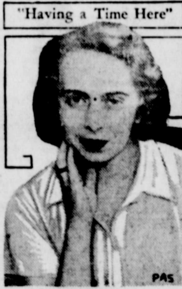
"Having a Time Here" NEW YORK . . . Above is Princess Katherine of Greece, 22, who is now in the U. S. on a trip around the world and "having a fine time here." She is traveling incognito, accompanied by two chaperones. One of her first stops was at Hollywood, Calif., to see movie stars in the raw.