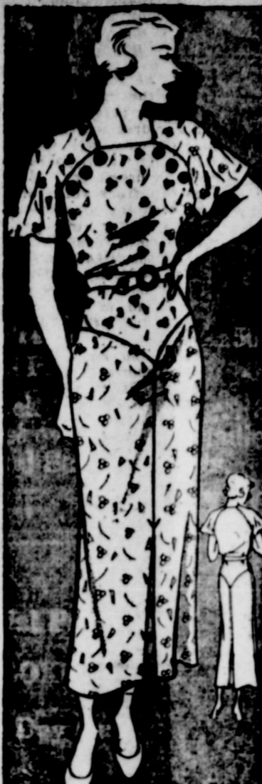
Designed in Size: 34, 36, 38, 40, 42, 44 and 46. Size 38 requires 4 1/2 yds. of 35 inch material.