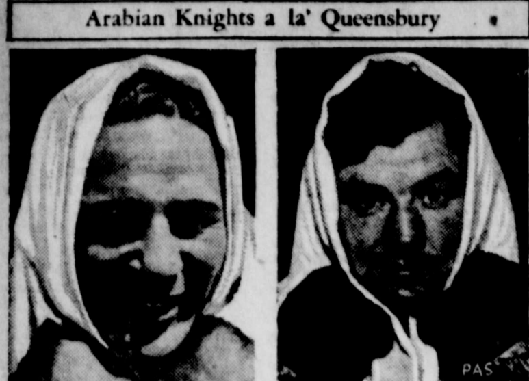
Arabian Knights a la' Queensbury NEW YORK . . . Either the news cameramen have bath towel complexes or else fight-camps are going "Arab", because here are current pictures from the training camps of Champ Max Baer (left), and challenger Jimmy Braddock (right), as they make ready for their open-air championship fight here on June 15th.