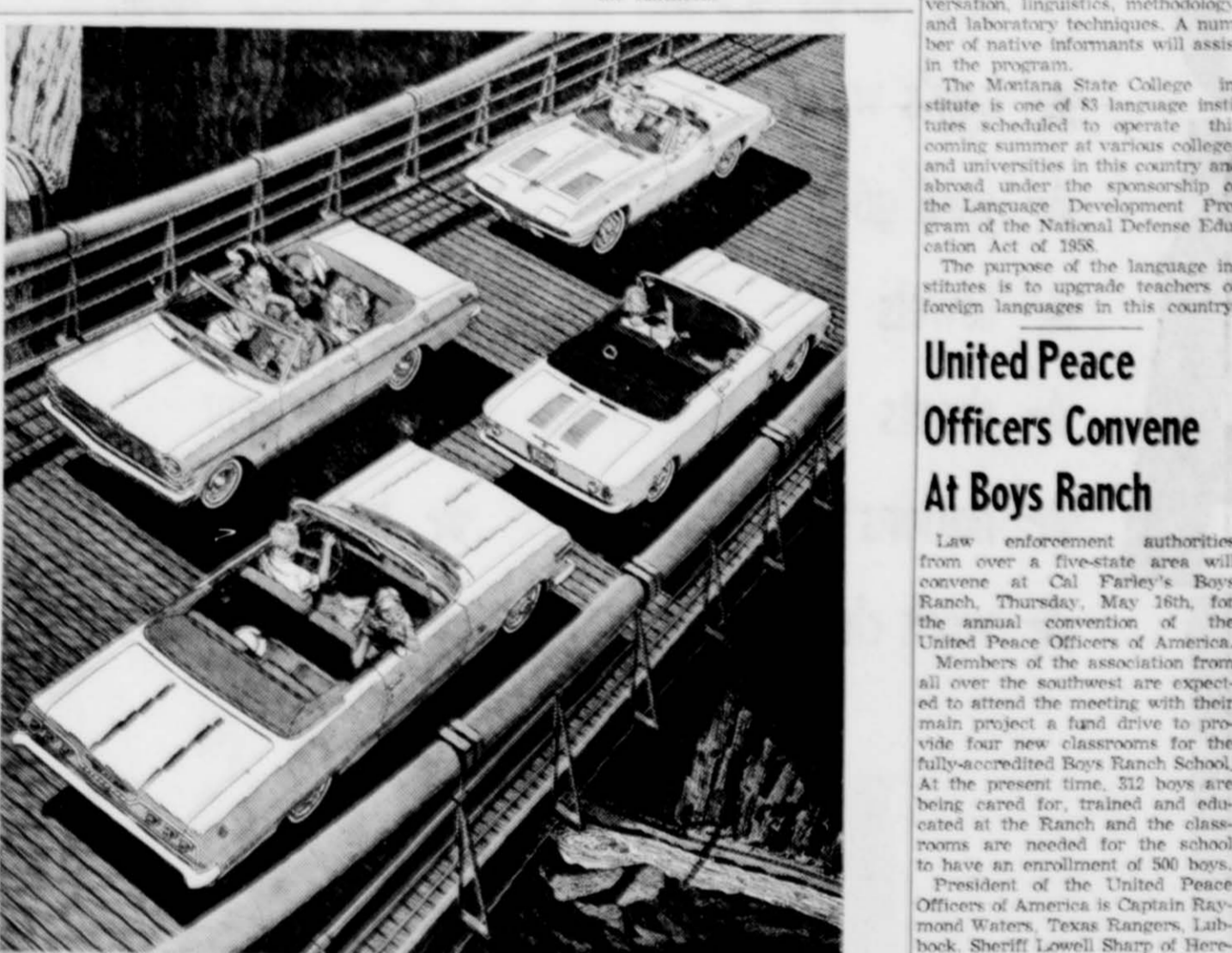
View from bottom: Jaramosa, Chevrolet, Impala, Chevy II Nova, Oldsmobile, Corvair, Buick Wildcat, Corvair Monza Spider