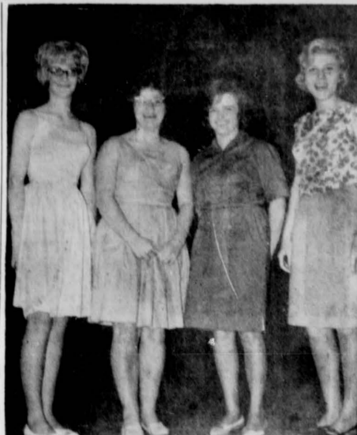
NAZARETH CHEERLEADERS for next year were announced Saturday night at an Appreciation Banquet...