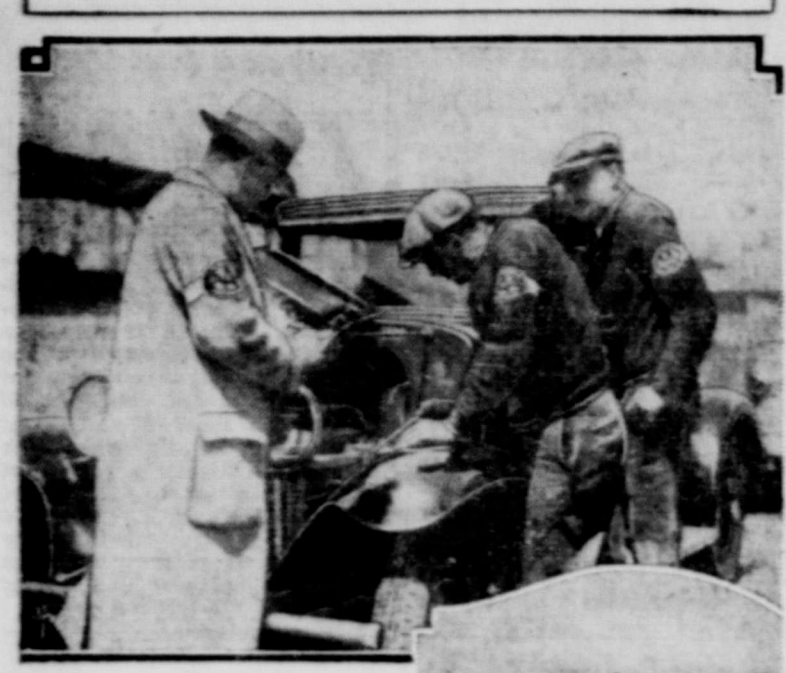
Oil Consumption is Cut 28.5 Per Cent in Run at Indianapolis

DRASTIC reduction in the cost of auto operation is forecast as a result of motor oil tests conducted at the Indianapolis Speedway under auspices of the A.A.A. Contest Committee.