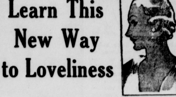
With Our Compliments