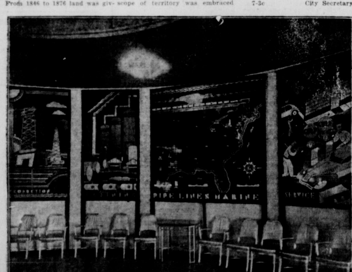
MODERNISM. FEATURED at Chicago's "A Century of Progress." A striking example is four the five amazing micarta murals depicting, symbolically, progressive steps in the career of gase and motor oils at the Gulf Refining Company's "all-action" exhibit. Micarta is made by a secret mula in which the glowing, marble-like effects are created with the help of dyed aluminum strike.

Free...a book that plans your meals for a year