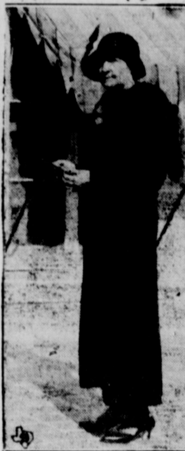
Here is the only woman to be elected governor of a state twice, Mrs. Miriam A. Ferguson. The pose is her latest, taken last week just after she had learned the result of the polling. Jim Ferguson, her husband has also been governor of Texas twice.