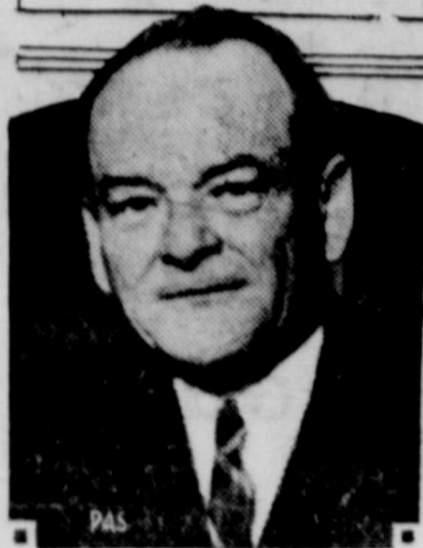
Congressman McDuffie of Alabama, one of the chief lieutenants of Speaker John N. Garner, now Vice-President elect, is mentioned as the next possible Speaker of the House after next March.