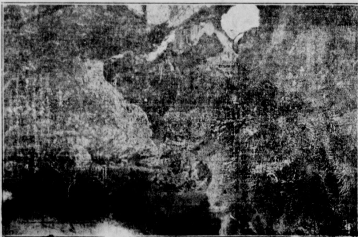
Here's a real "look-see" of the new "look-see" of the world's great wonders found in Texas. The photograph was taken in the newly discovered and named Longhorn Cavern, about 50 miles northwest of Burnet. It has definitely established the fact that Texas is a land of wonders.