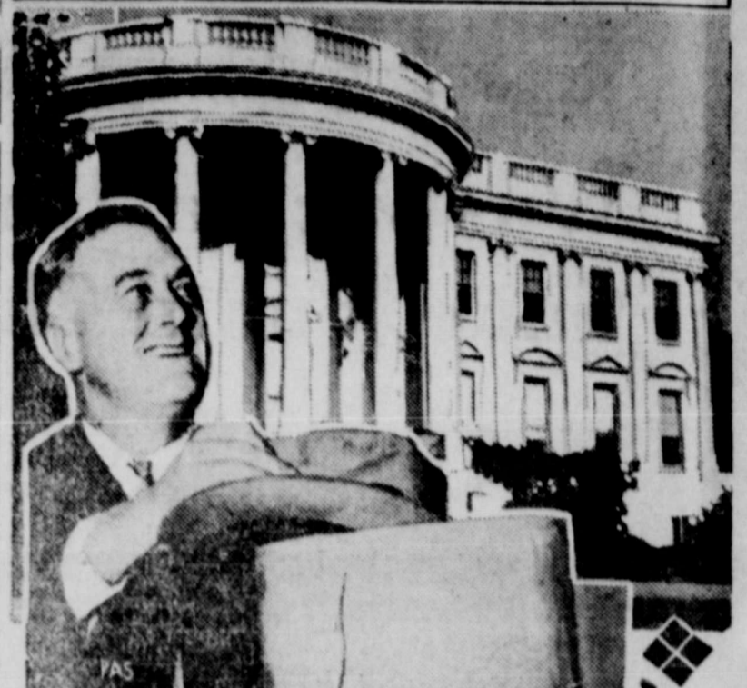
President-elect Franklin D. Roosevelt tossed his hat into the presidential ring several moons ago. It was kicked about quite a lot but it came through, battered a bit 'tis true. Now it rests secure in a safe at Albany, awaiting a jaunt to Washington. . . . The President-elect is mighty particular about that hat . . . a gray fedora which came to be known throughout the land. One of his first acts on November 9th was to place it away.