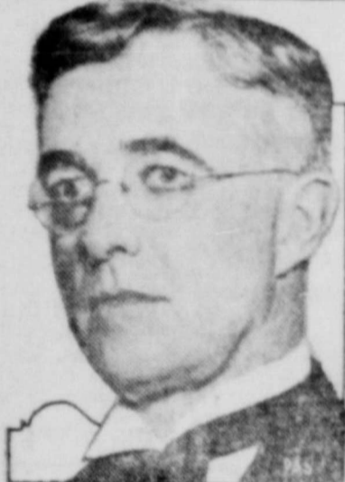
Dr. Irving Langmuir, 51 years old, Schenectady, N. Y., has been awarded the 1932 Nobel Prize in chemistry, an honor bestowed for unusual achievement. He is director of an electric company's laboratory.