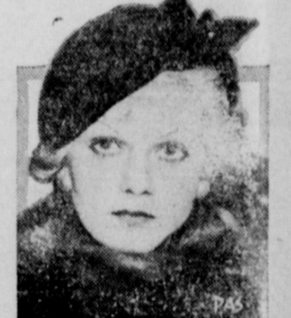
Jean Harlow, platinum blonde of the screen, as she appeared in court this week at the probating of Paul Bert's will, her late husband, whose suicide startled the movie colony.