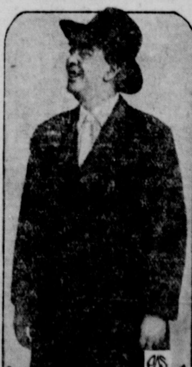
Richard B. Harrison, the Negro actor who plays the part of The Lord in the religious drama "The Green Pastures," the outstanding theatrical hit of the past year, whose actors are all Negroes, has been awarded the Spingarn medal, given annually for the highest achievement of an American Negro.