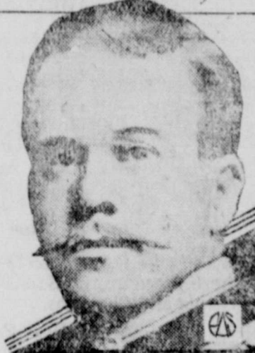
Vere Brabazon Ponsonby, Earl of Bessborough, who has been appointed Governor-General of Canada. He is a World War veteran and his wife is of French birth.