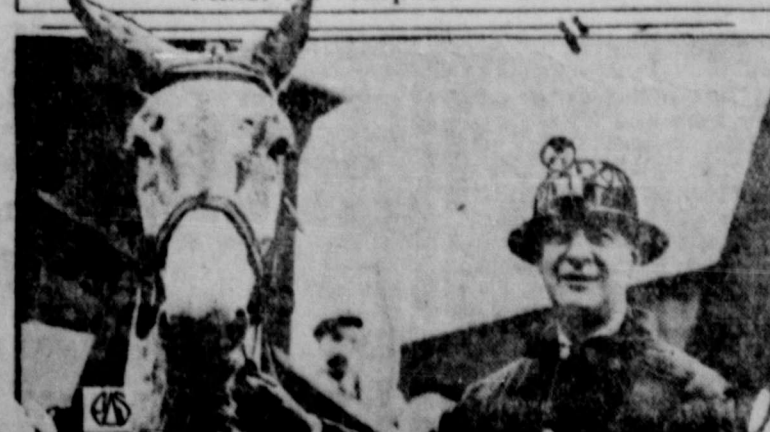
Ex-Governor Alfred E. Smith, of New York, is pictured above with "Maude," one of the coiest mules at the Marvne Colliery of the Hudson Coal Company. The snap was taken on a recent inspection trip of the "Happy Warrior" through the Scranton, Pa., coal mines. Al remarked the mule would make a good mascot for the Democratic Party.