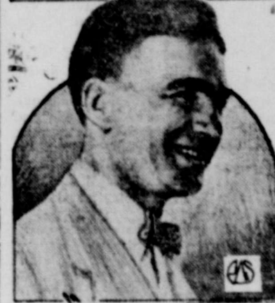
David Sinton Ingalls, Assistant Secretary of the Navy in charge of aviation, who is an expert flyer himself.