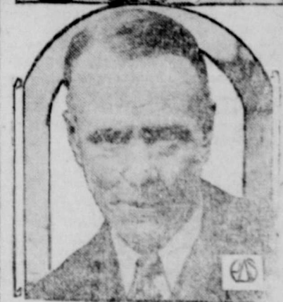
Theodore Dreiser (above) got a good laugh when Sinclair Lewis (below) accused him of stealing a chapter from one Mrs. Lewis' books. Dreiser says Lewis' face and that was it.