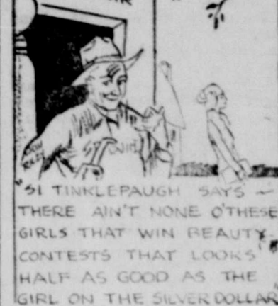
"I TINKLEPAUGH SAYS THERE AIN'T NONE O' THESE GIRLS THAT WIN BEAUTY CONTESTS THAT LOOKS HALF AS GOOD AS THE GIRL ON THE SILVER DOLLAR"