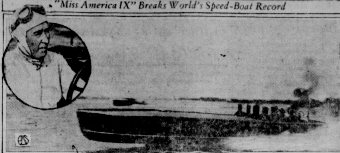
Gar Wood, Detroit's famous designer of fast boats, drove his "Miss America IX" over a measured nautical mile at Miami Beach at a speed of 102.25 miles per hour. This beats the world's record of 98.76 miles an hour established last year by Sir Henry O. D. Segrave in England.