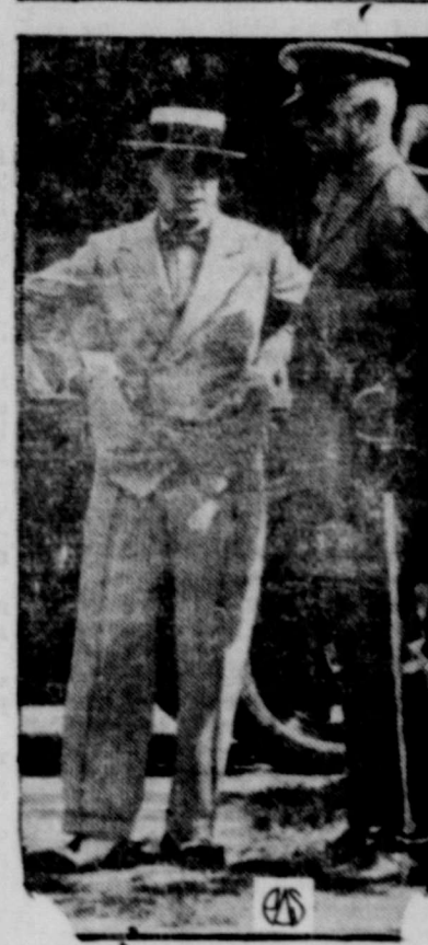
The Prince of Wales stopped off in Panama on the way to South America and General Preston Brown, U. S. Aviation Corps, commandant at France Field, showed him around. The Prince was very normal about it, as the photograph shows.