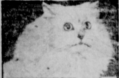
First Prize Cat "Lady of the Moon," a shaded silver cat which won first prize at the Atlantic Cat Club show in New York.