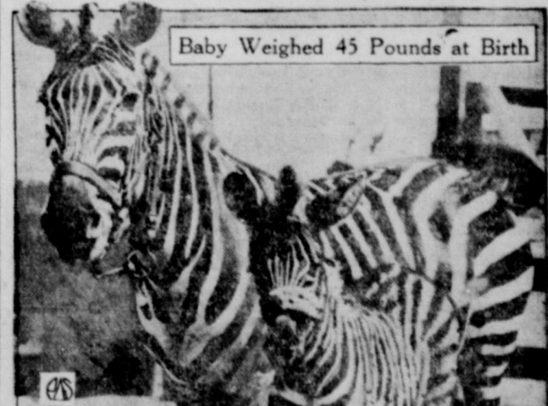
The youngster shown above, just two weeks old, weighed 45 pounds at its birth. He is a member of the zebra family in the winter quarters of a circus in Los Angeles, Cal. It is expected he will be big enough to barnstorm with the circus this summer.