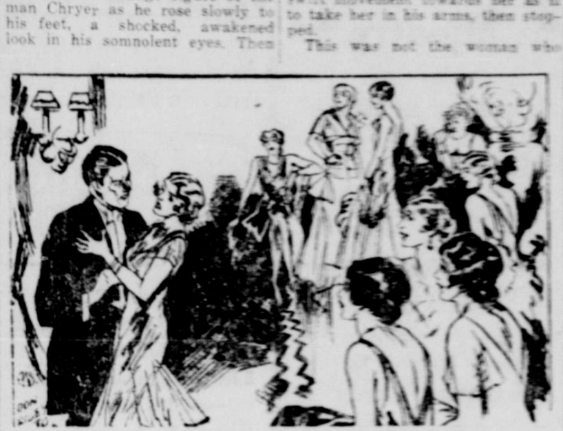
A piercing scream rang through the silence of the room, a scream in the frightened voice of a woman, and then the cry of his own

keep silent about their marriage. was standing up, her hands cov- What a food he had been not to She formed but for the face her shifted by the hands outstretched.