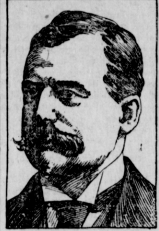
SENATOR BOIES PENROSE

short session had the effect early in the day of giving the capitol an appearance of activity such as it has not presented since adjournment last June. The first day's session never develops much interest to those used to attending sessions, but on no other day does it seem to possess a greater charm for the average citizen. Both visitors and members found the great building in excellent shape to receive them. Vast as is the structure, it has been thoroughly renovated both inside and out during the recess, and it looked clean and inviting. All committee rooms have received a thorough overhauling. Pictures have been repuvenated and the two chambers completely cleaned up. ort session had the effect early in the