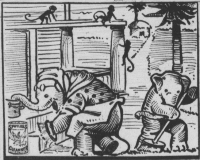
The busy bee Uses Spotless Cleanser And lives in glee