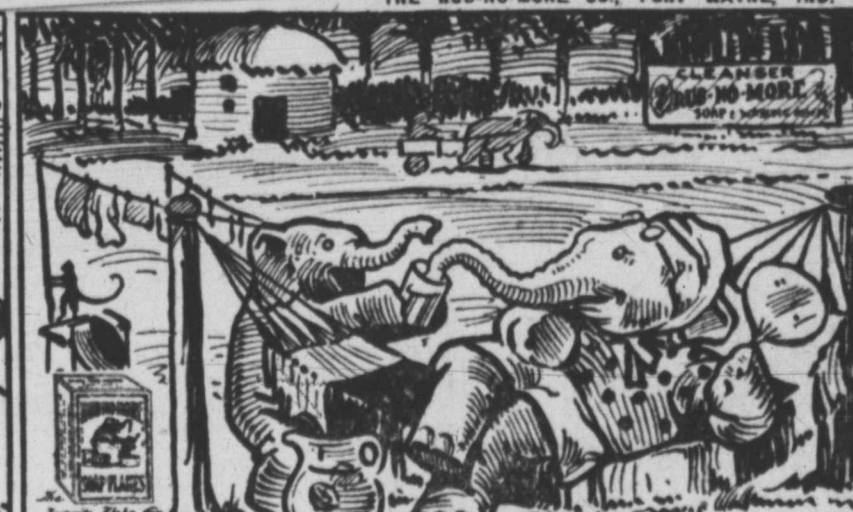
In Jungle Town, there is no frown No......day worry either Since RUB-NO-MORE Soap and Powder Have entered in as cleaners......

Obituary Poems Are as Welcome as the Smallpox