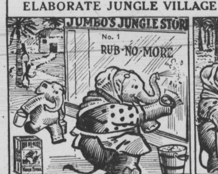
Washing ..... was a task That made the baby sore Until he learned the ease __'Twas done with RUB-NO-MORE

A MOST EDUCATIONAL TOY FOR THE CHILDREN. ABSOLUTELY FREE! FILL IN THE MISSING WORDS IN THE POEMS BELOW AND MAIL THE CLIPPINGS TO US TOGETHER WITH -10. ELEPHANT OR DOVE TRADE MARKS, CUT FROM THE FRONTS OF OUR PRODUCTS AND WE WILL FORWARD PROMPTLY, ALL DELIVERY CHARGES PREPAID, A COMPLE