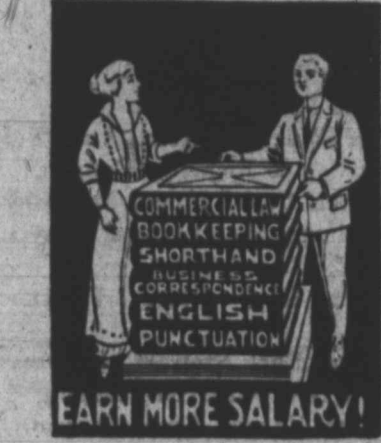
THE MORE YOU KNOW