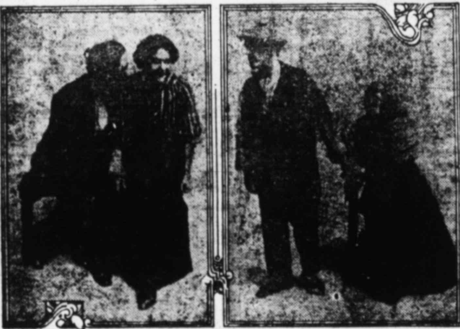
THE IRISH PLAYERS.

LAX-FOS IS AN IMPROVED CASCARA A Digestive Liquid Laxative, Cathartic and Liver Tonic. Contains Cascara Bark, Blue Flag Root, Rhubarb Root, Black Root, May Apple Root, Senna Leaves and Pepsin. Combines strength with palatable aromatic taste. Does not irritate. 50c