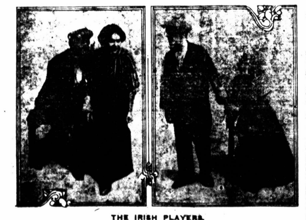
THE IRISH PLAYERS. At the Normal November 12th

No action was taken Tuesday by the representatives of the Baptist Association in regard to the purchase of the Canyon City Club grounds for the purpose of making a general meeting place for the Baptists of Northwest Texas.