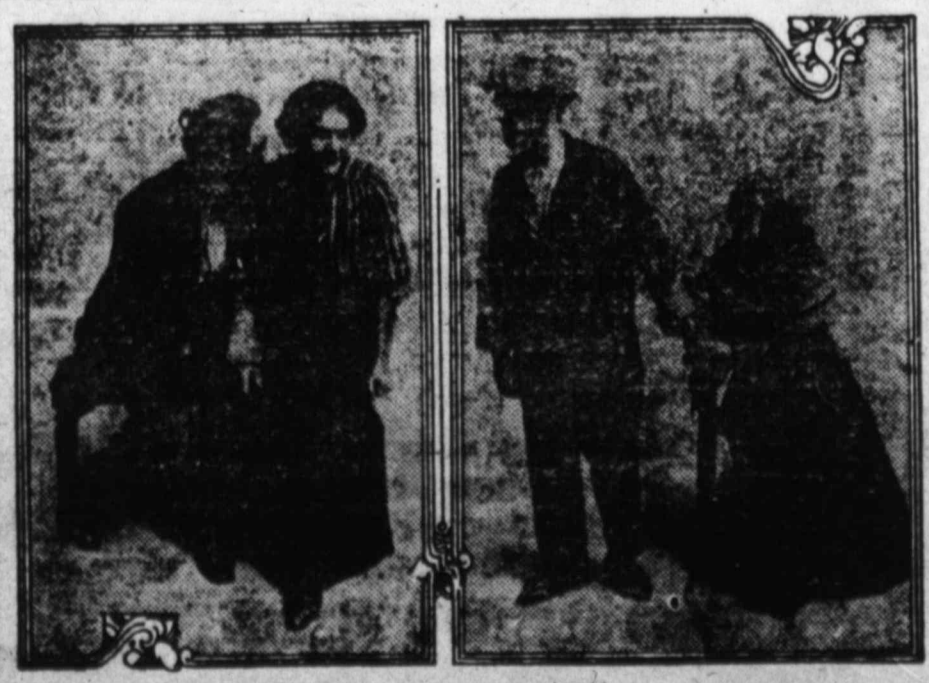
THE IRISH PLAYERS.