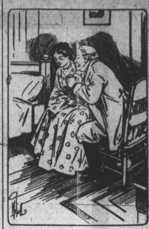
"You Know What I Mean-That I Love You."

Her eyes were upon his face, a slight flush showing in either cheek, and she made no effort to withdraw