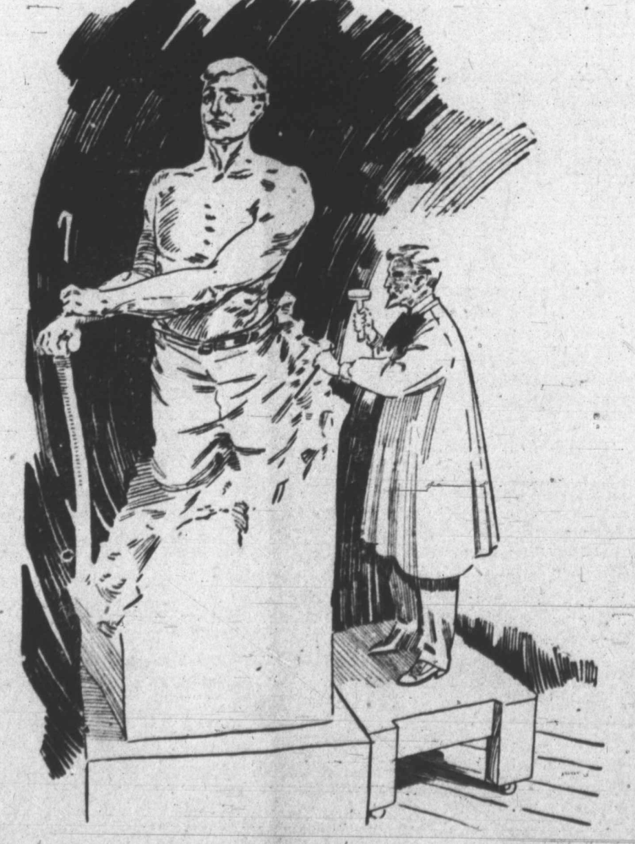
A MASTER HAND.

ICHAEL Angelo made the canvass glow with life and Phidias made marble speak and throughout ages civilization has felt the elevating influence of the painter and the sculptor. Their success was due to the fact that they had the ability to put the stuff in their work and what is true in art, is also true in government. We need in our Legislature men who can put the stuff on our statute books that will make industry glow with life and the soil speak with a glorious harvest.