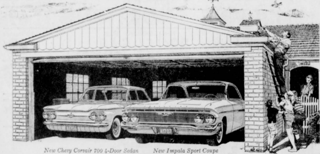
New Chevy Corvair 700 4-Door Sedan New Impala Sport Coupe

Ask your dealer about a real cool extra-cost option—Chevrolet air conditioning.