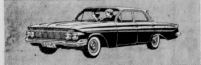
New Bel Air 4-Door Sedan—Popularly priced and packed with all the Chevy virtues.