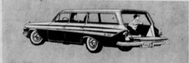
New Nomad 9-Passenger Station Wagon—Most luxurious of Chevy's six best selling wagons.

See the new Chevrolets at your local authorized Chevrolet dealer's