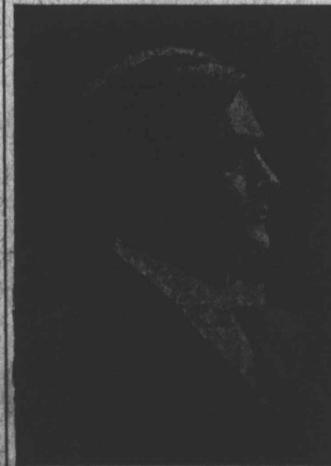
HON. O. B. COLQUITT. Elected Governor of Texas by 165,000 majority.

"The Sweetest Girl in Dixie" was played at the opera house Wednesday night to a very good house. The play was well given the comedy part being by far the best in the company.