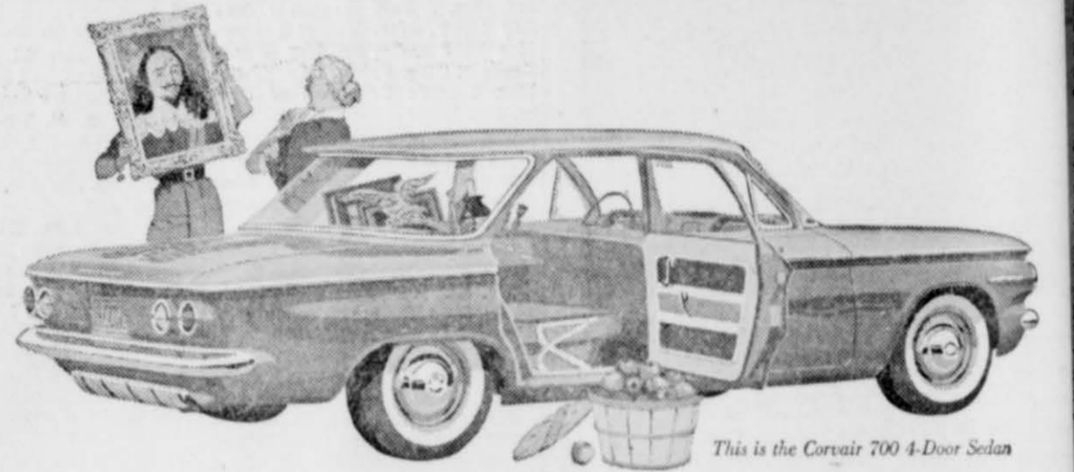
This is the Corvair 700 4-Door Sedan

For economical transportation—CORVAIR BY CHEVROLET