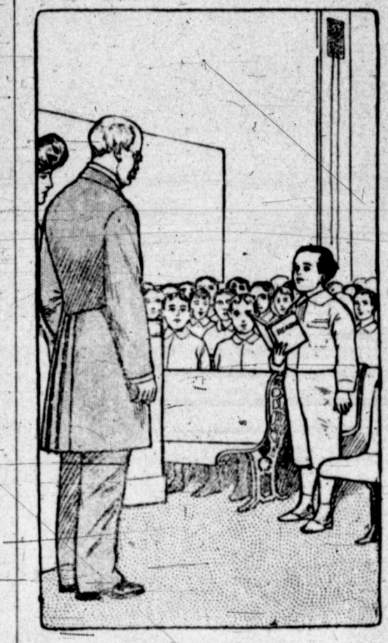
THE BOY WAS ASKED TO READ.

While visiting a school in Brooklyn he noticed that one of the boys had, something the matter with one eye. He asked the boy to read first