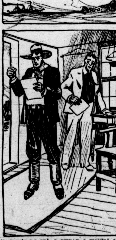
"I WON'T DO IT! I SWRAR I WON'T! I'D wavered that he "wouldn't go back to

"No, I won't do it!" he shouted. He lingered two days in Amapala, repeating over every time his spirits