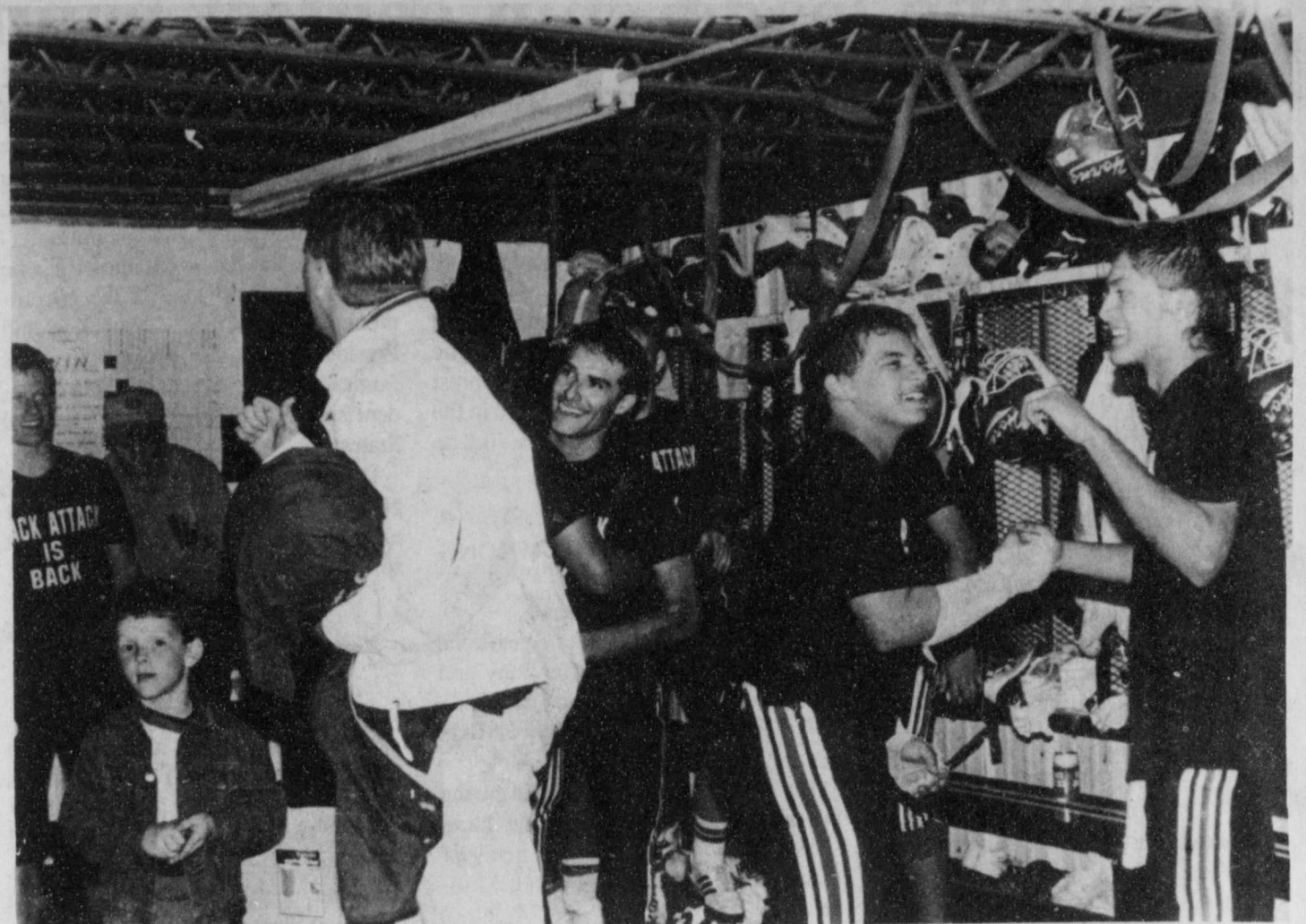
HEY GUYS, YOU DID GREAT!--A local fan congratulates excited Lockney Longhorns on their first win at district play. The Longhorns defeated the Springlake-Earth Wolverines in a home game.

The Longhorns will travel to Shallowater on Friday night. The game is scheduled to begin at 7:30 p.m.