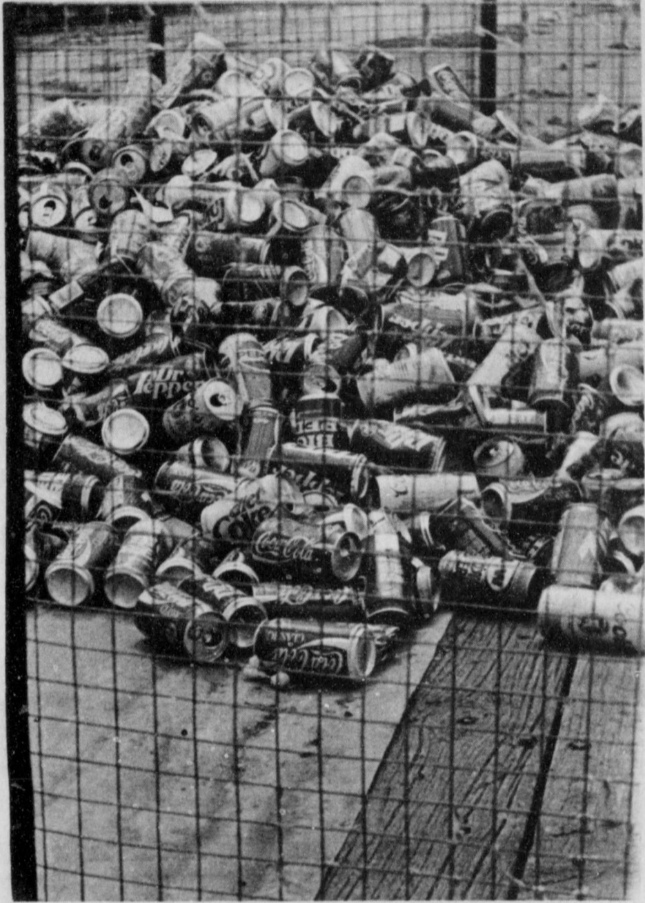
LET'S FILL THE TRAILER AGAIN!--The Ambulance Fund was increased by $722.00 when the volunteer firemen hauled the aluminum cans to the recycling center. This is an easy way to add to the fund and the trailer is sitting in the same location as before. Think "new ambulance" and donate your cans. They do not help anyone taking up space at the landfill.