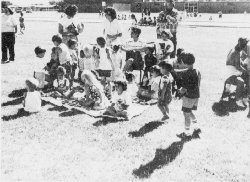
NICE DAY FOR A FIELD TRIP -- The students and teachers at Lockney Elementary School were joined by their family and friends at a fun and field day last Friday. The games and races are part of an annual event held before school turns out each year.