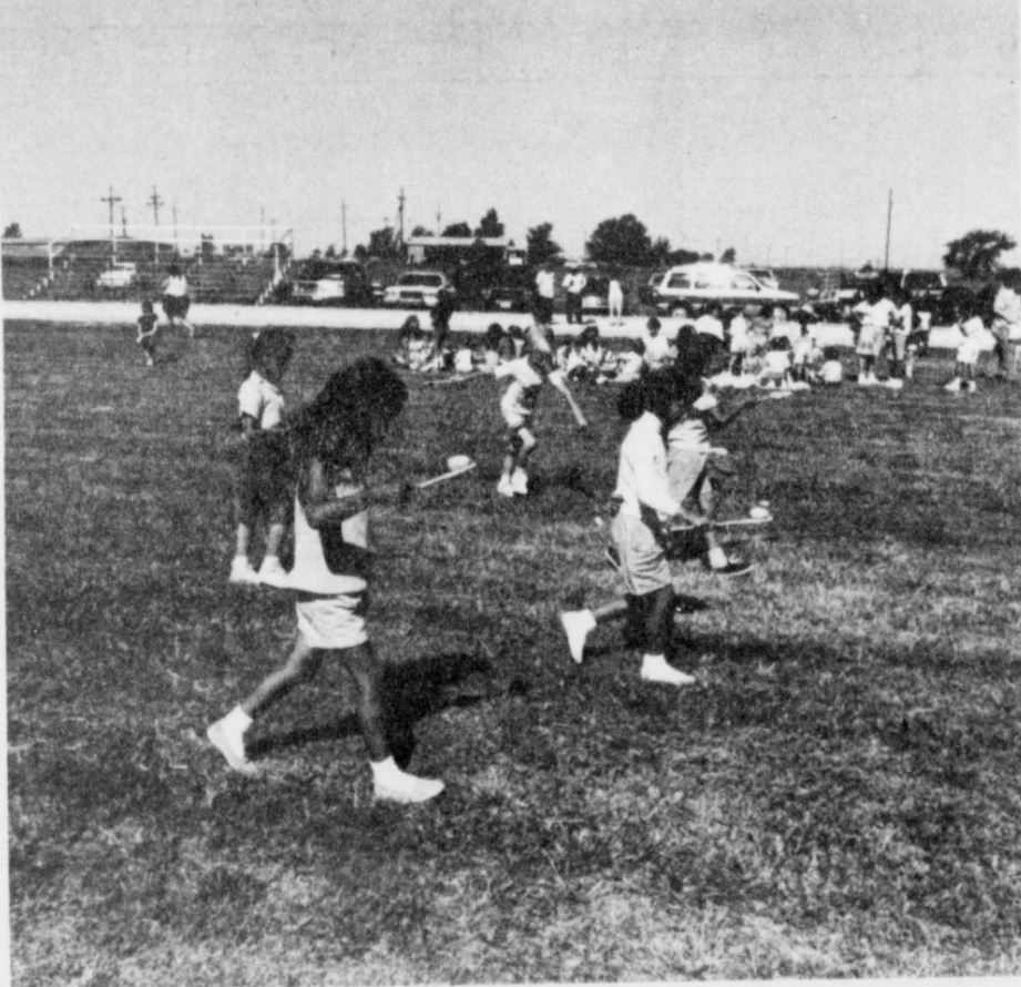
OOH - I HAVE TO BE CAREFUL-- Racing to the finish line with a raw egg on a wooden spoon is no easy task as these students at Lockney Elementary School found out. Students along with their teachers, family and friends enjoyed an outing at their annual fun and field day last Friday. Students were awarded ribbons for their efforts.