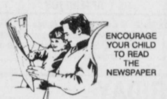
ENCOURAGE YOUR CHILD TO READ THE NEWSPAPER