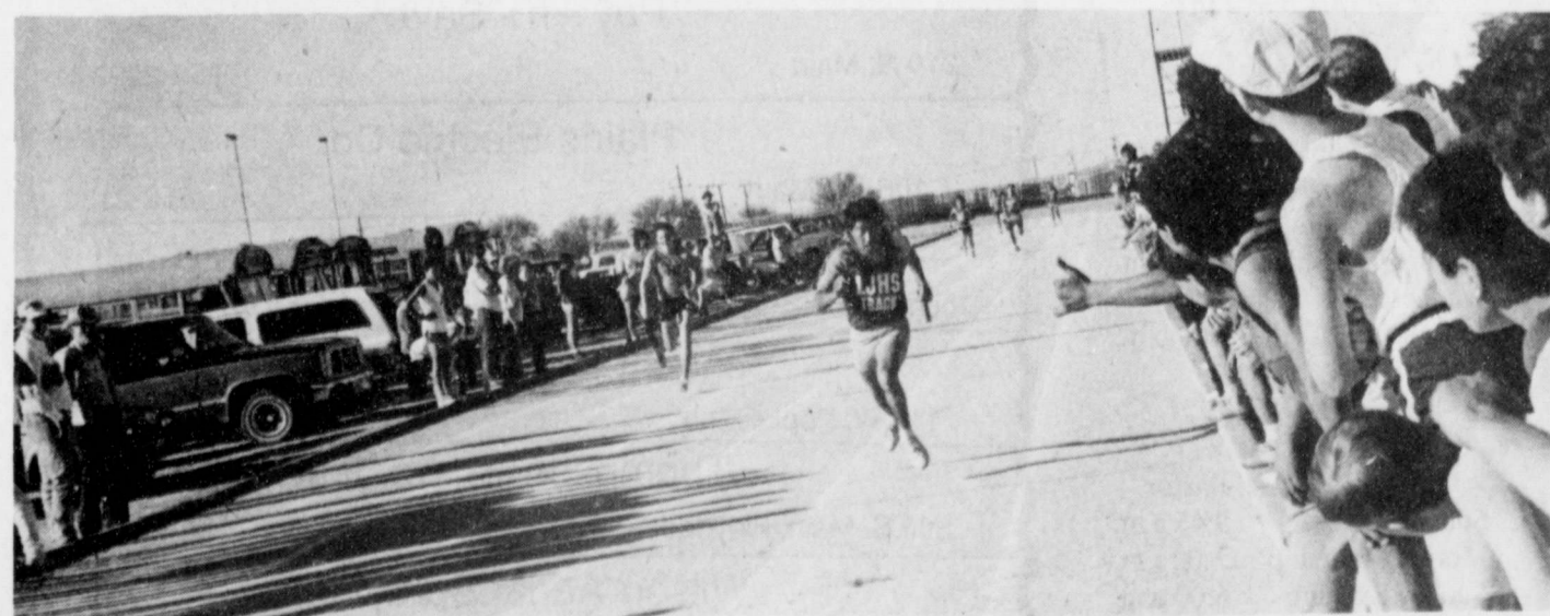
LOCKNEY JUNIOR HIGH TRACK MEET --This speedster come down the track in front of the pack in the 100 yard dash at the Lockney Junior High Track Meet held Thursday, March 8 at the Longhorn Track. The weather cooperated and the well wishers cheered him on.