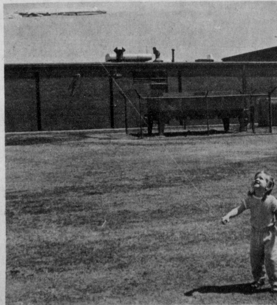
KITES ARE UP -- The advent of a west Texas spring always brings with it windy days. Some of Lockney's younger citizens have the knack and the ability to turn windy weather into a real fun time. This delightful little girl has managed to get her kite in the air and watches it rise to new heights with a look of wonder and awe on her shining face.