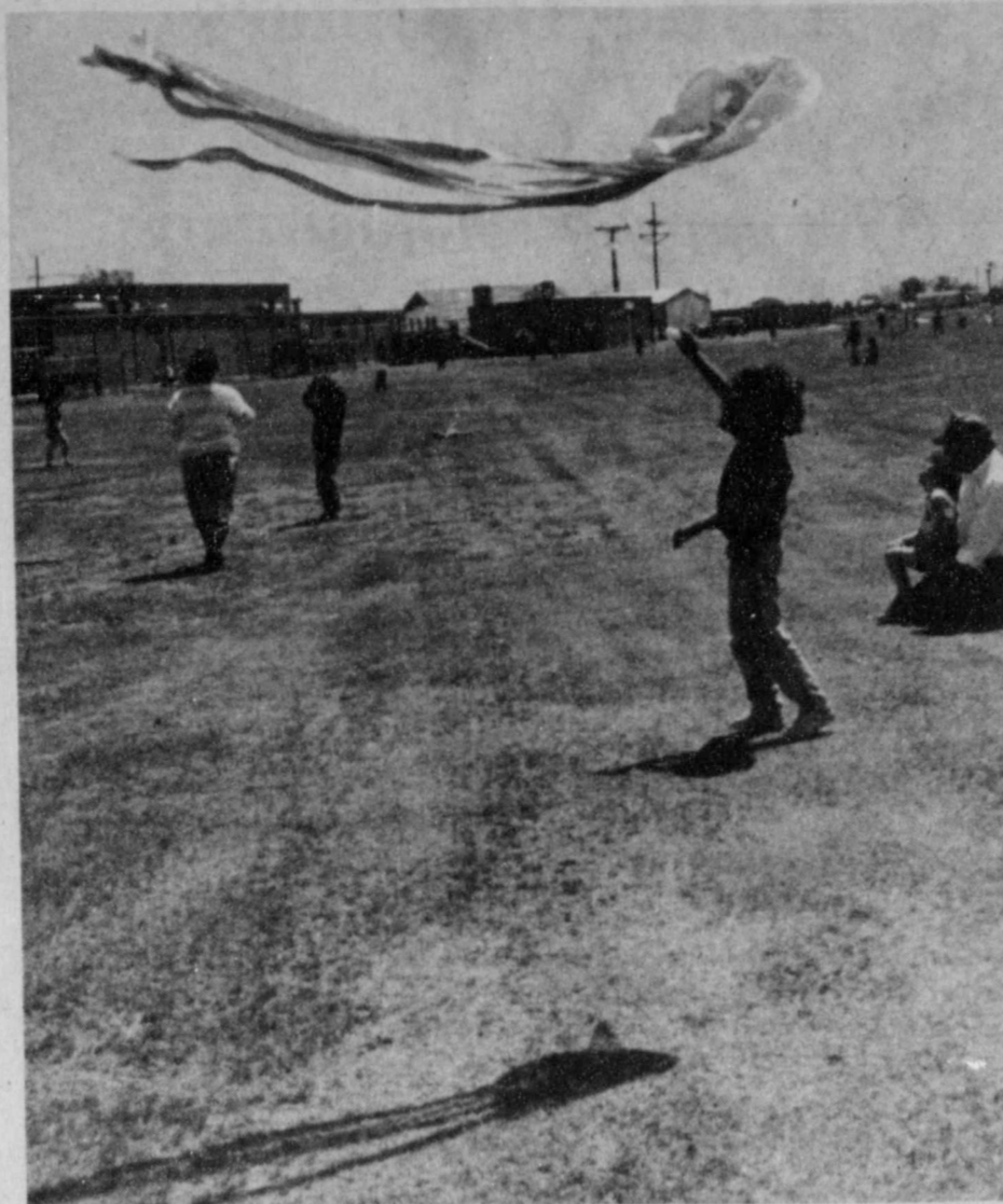
IT'S OFF THE GROUND AND FLYING—Last Friday afternoon the wind was just right for kite flying and the students at Lockney Elementary tried their hand at this age old sport.

To ensure maintaining levels of calcium, women should include the following calcium rich foods in their daily diets: yogurt, sardines, collard greens, milk and kale. Calcium supplements can also battle osteoporosis.