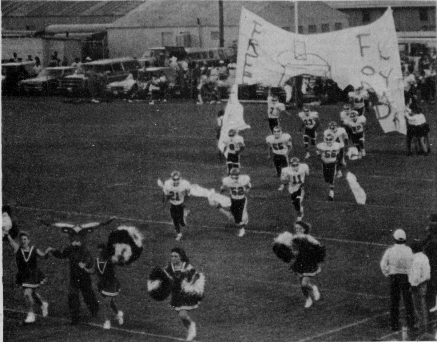
BRING ON THE TEAM- Lockney varsity cheerleaders and the Longhorn Mascot lead the Lockney varsity team onto the field before last Friday night's game against Floydada. With the County Championship on the line, team spirit and fan enthusiasm was not enough to chalk up