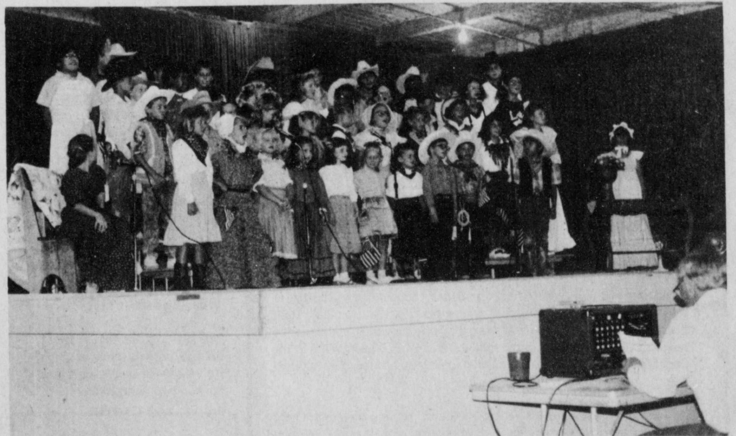
BENEFIT PERFORMANCE- The Lockney Elementary students who have been working diligently to perfect their performances of "How the West Was Really Won" are presenting a special show to raise money to replace equip-

We do hope that you can be with us at least one of the days during this Homecoming, Super '88. If for some reason you are unable to attend, please send a letter about yourself to share with your classmates. If you can attend, please RSVP to your class representative as soon as possible to help our planning. We hope to see all of you.