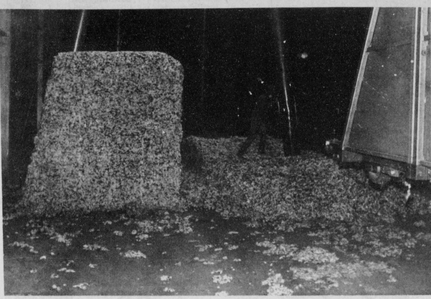
FAMILIAR SIGHT — An unidentified Lockney Gin employee mans the suction Monday night as processing of the '86