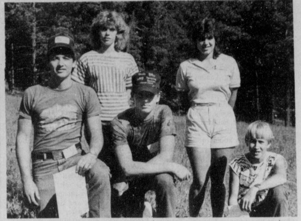
ELECTRIC LEARNERS —Five Floyd County 4-H'ers spent five days recently [June 17-24] in a mountain camp near Cloudcroft, New Mexico, learning about electricity. Southwestern Public Service Company [SPS] was host and provided instructors for groups from 19 Texas South Plains counties.