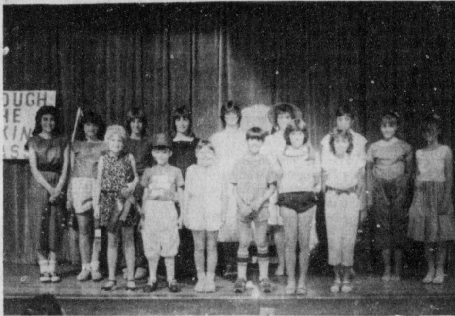
FASHION SHOW PARTICIPANTS—These fifteen Floyd County 4-H members all participated in the county fashion show in Lockney this past weekend. All the junior and senior first place winners will advance to the district contest to be held Friday in Lubbock.