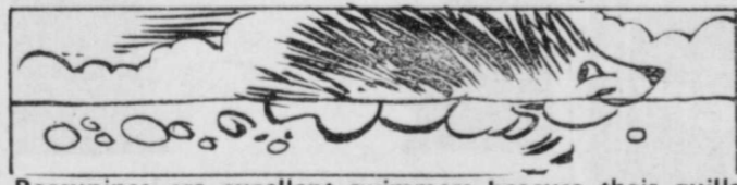
Porcupines are excellent swimmers because their quills are hollow and help to keep them afloat.

The first invitation, issued June 15, resulted in successful contracts for the export of $22.7 million of commodities to six countries. The second invitation, issued November 30, resulted in successful contracts for the export of $38.9 million of commodities, also to six countries. This leaves a balance of $28.4 million of commodities available for sale and export under the third invitation.