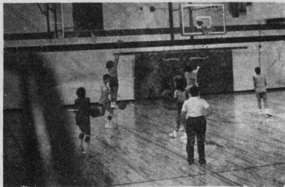
VARSITY GIRLS go through drills and shooting practice in preparation for the Slaton Tournament which starts today.

With the yield almost being triple what last year's yield was we can hope that next year weather and government programs will not interfere with next year and farmers can again increase over the year's yield.