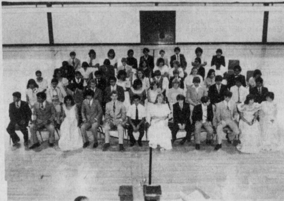
1983 EIGHTH GRADE graduating class of Lockney Junior High.