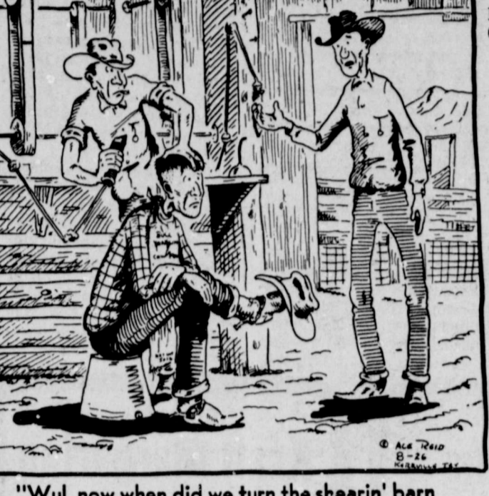
"Wul, now when did we turn the shearin' barn into a beauty parlor?"