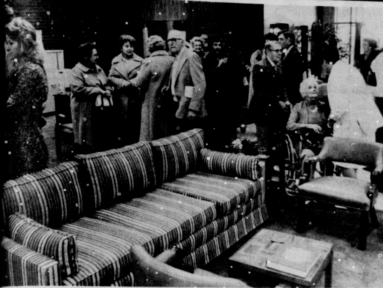
More than 400 persons, it was estimated, viewed the newly remodeled facilities at the First National Bank in Lockney.