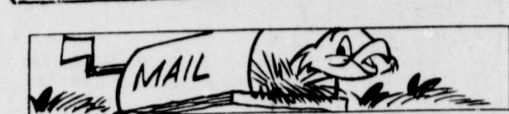
The Georgia home of Joel Chandler Harris, creator of Uncle Remus, is called Snap-Bean Farm, or The Wren's Nest because a wren once built a nest in the mailbox.