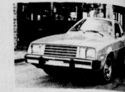
PINTO A Lot Of Small Car A Lot Of Economy Not Much Money

Win Sweepstakes Prizes! 20 Friedrich Room Air Conditioners 9 Ford LTD's Win the use of a new Ford LTD for a year! Nine LTD's will be awarded. Now you know why we call this the Great Ford Sweepstakes.