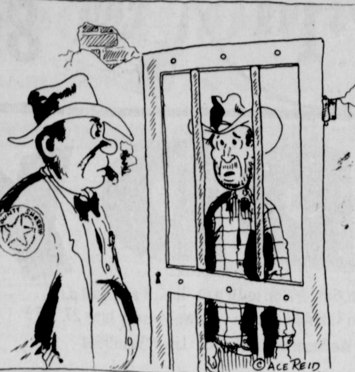
Sheriff, I didn't steal them steers.....I jst beat the other feller to em!