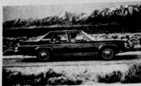
LTD Americas Road Car Up To $1,800 Discount Off List On Units In Stock