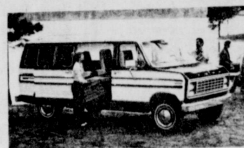
CLUB WAGON In Stock - Up To $2,100 Dollar Dealing Discount