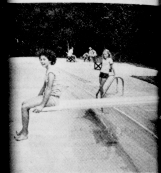
Club features the largest swimming pool in the West Texas.