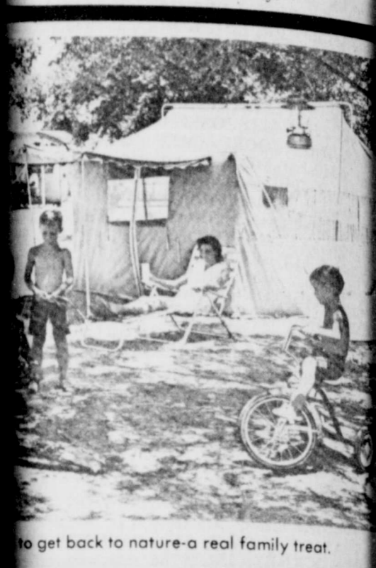
to get back to nature—a real family treat.

The Lockney B&PW Club was one of the hostess clubs