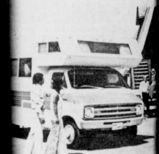
weekend or vacation. Springs Ranch Club, the best Texas.