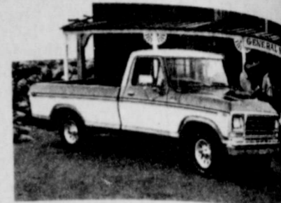
PICKUPS Americas Best Seller 302, 351, 460 V-8's Regular & Super Cab & Bronco 2 & 4 Wheel Drive. Dollar Dealings Discounts On Stock