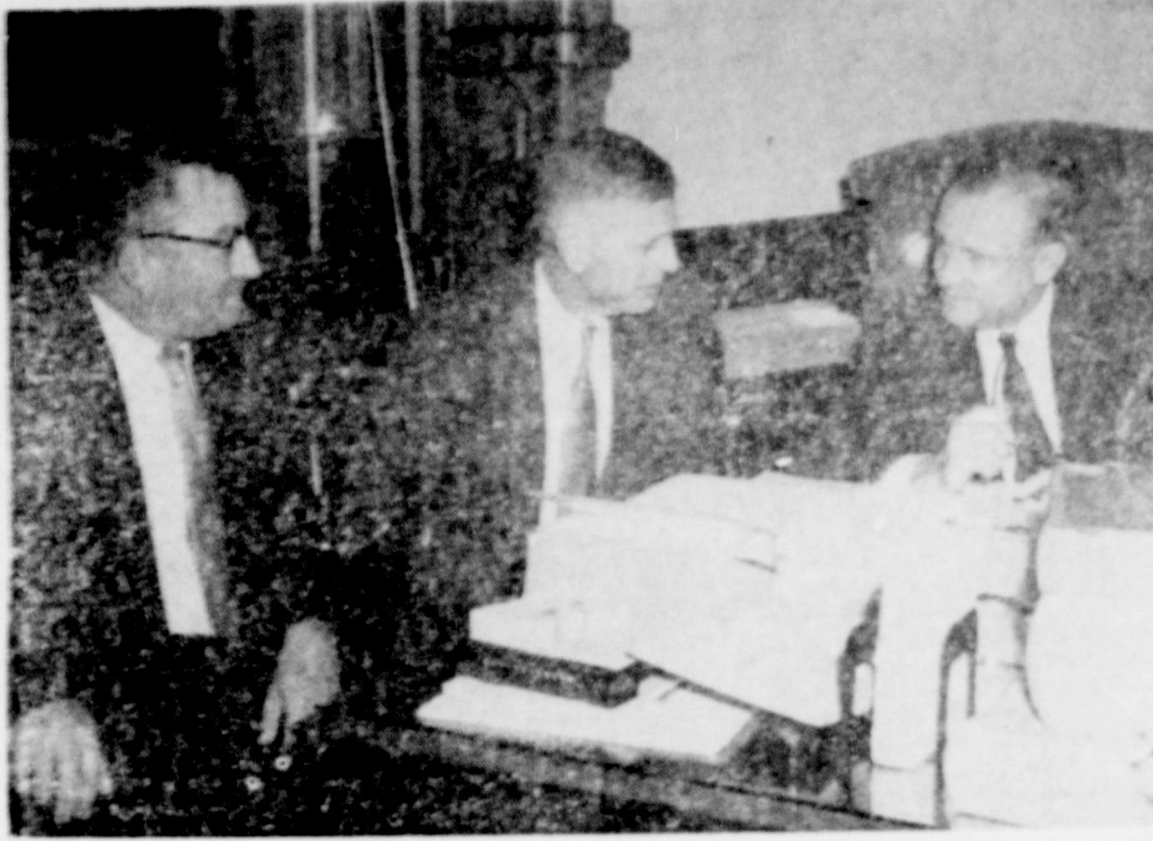
FARMERS DISCUSS RESEARCH WITH GOVERNOR —Two Texas farmers are shown discussing the need for an expanded agricultural research program in Texas with Gov. Price Daniel (right)