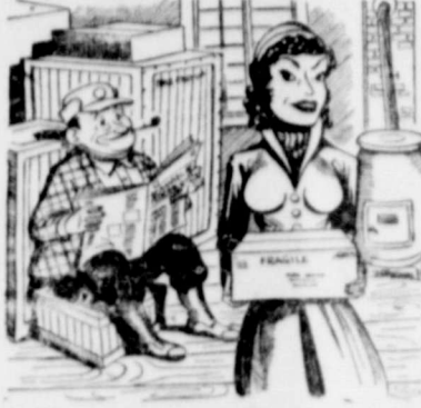
"If I've got to pay for these mink coats and deep freezes, I'd like a chance to use 'em!"