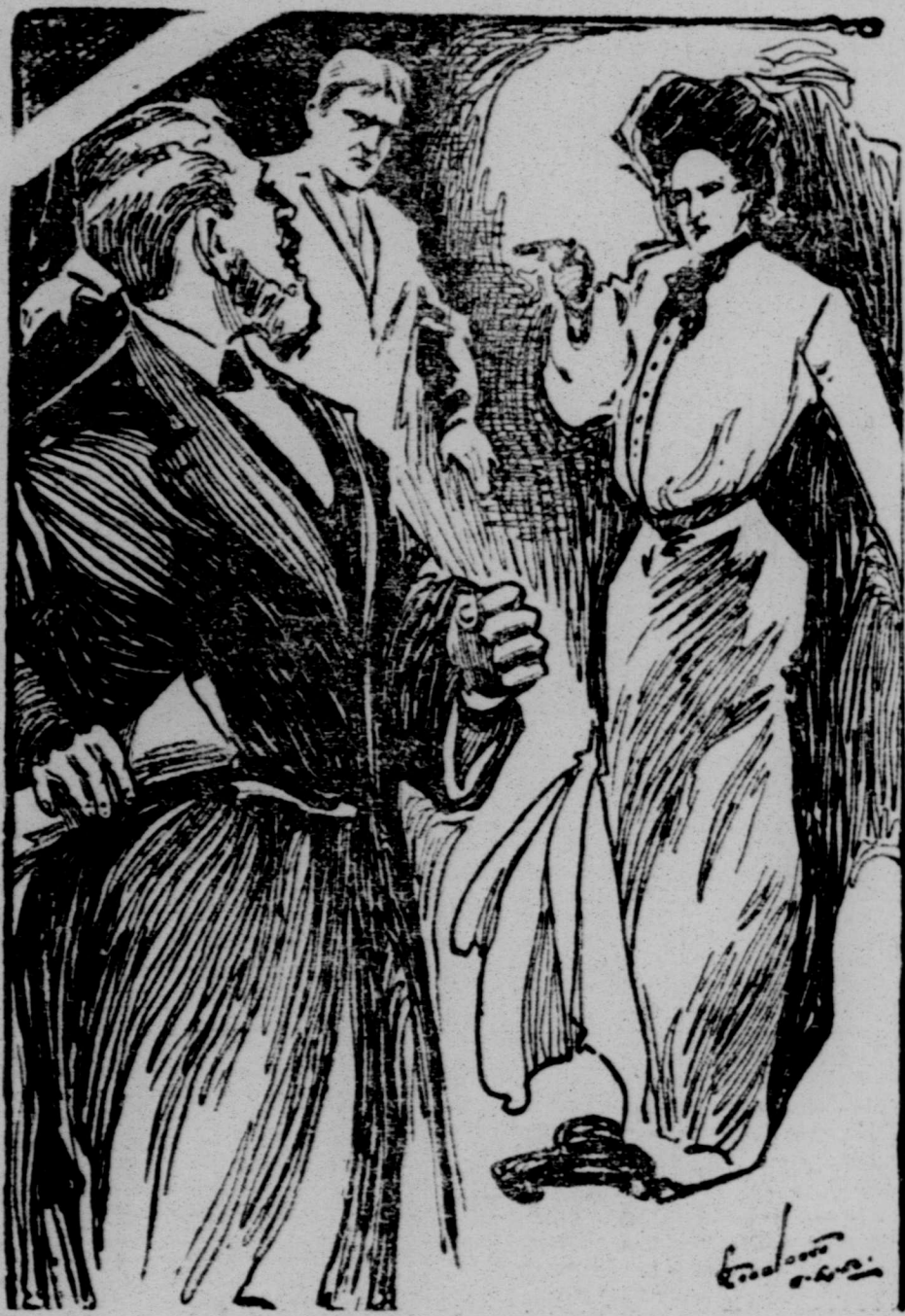
SHE SNATCHED UP THE PISTOL. "GIVE HIM BACK THOSE PAPERS," SHE COMMANDED.

"An invitation to dinner, I presume," he remarked. "The duke sent for me," my stepmother said, quietly.