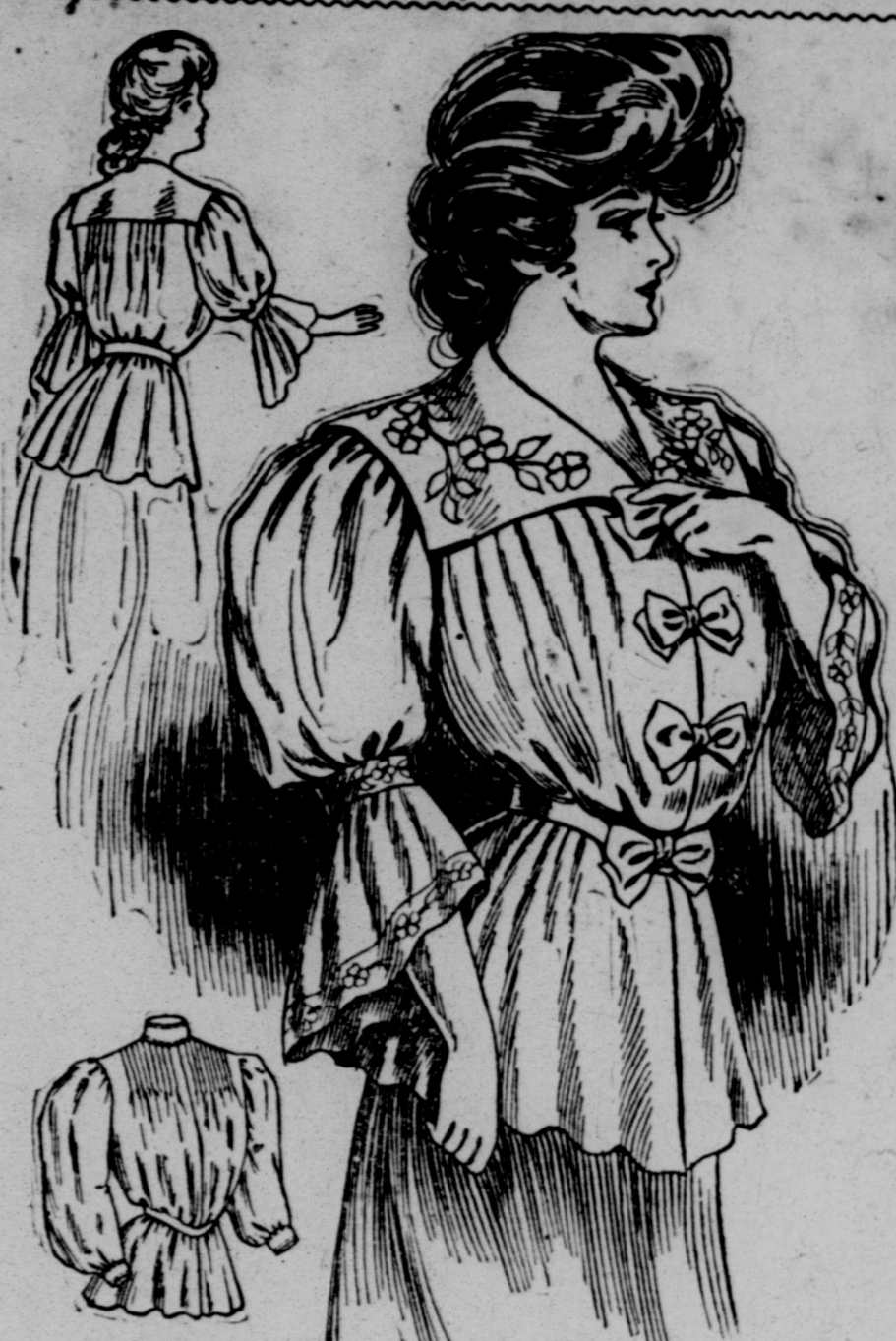
No. 2714—A Dainty and Becoming Dressing Sack.

How often have blessings been called down upon the inventor of the dressing sack.