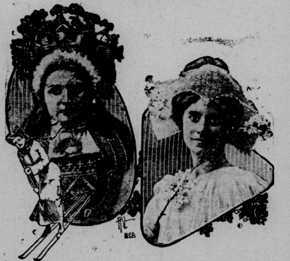
On the left is shown a peasant bride in her wedding dress and crown, and on the right a high-born Norwegian woman in one of the national headdresses.