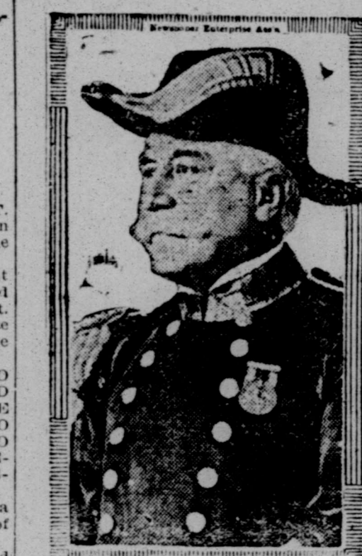
ADMIRAL GEORGE DEWEY.

CHRISTIANA, Norway, June 1.—All party feeling has been obliterated in the face of the crisis between Norway and Sweden.