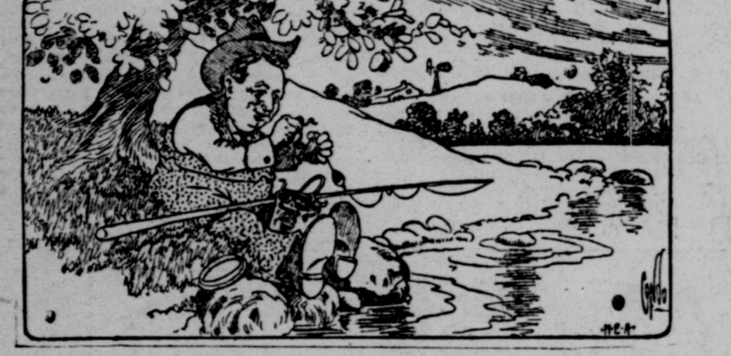
This shows what the judge was really fishing for.