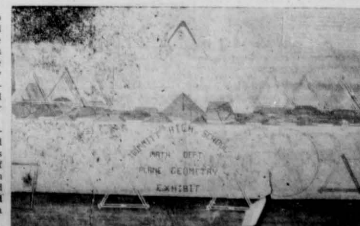
THEIR HANDWORK ON DISPLAY

room as a workshop last year. Addition of the new south elementary school and cafeteria, however, alleviated the crowded conditions, and this year the old cafeteria west of the high school building was converted into a workshop. Each geometry student has spent more than 20 hours in the workshop constructing instruments and proof-of-theorem figures.