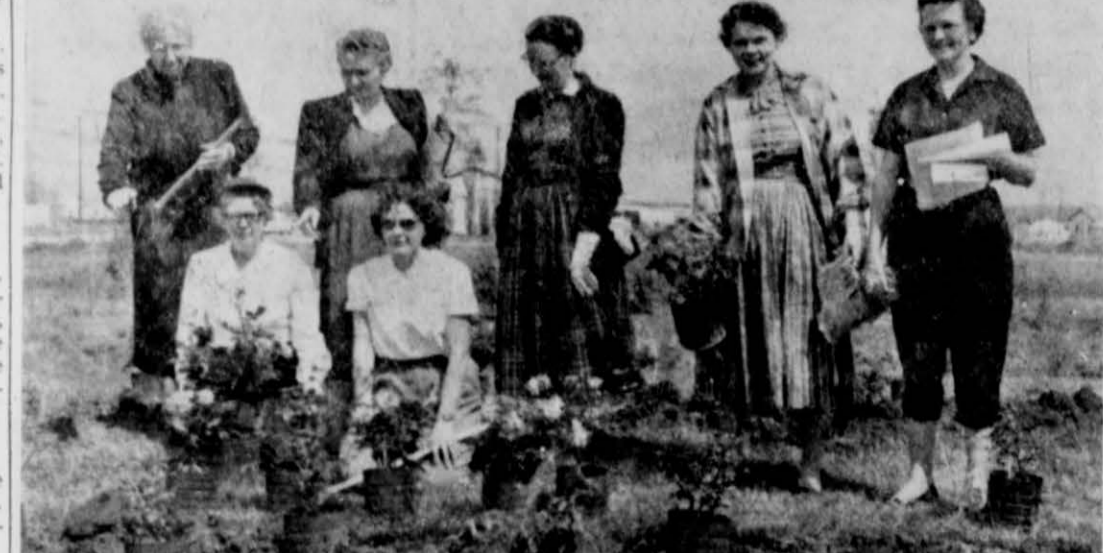
The rose garden, located in the northwest corner of the park, will contain more than 20 varieties of roses. The rose garden was included in the park's original design; shrubbery surrounds it.