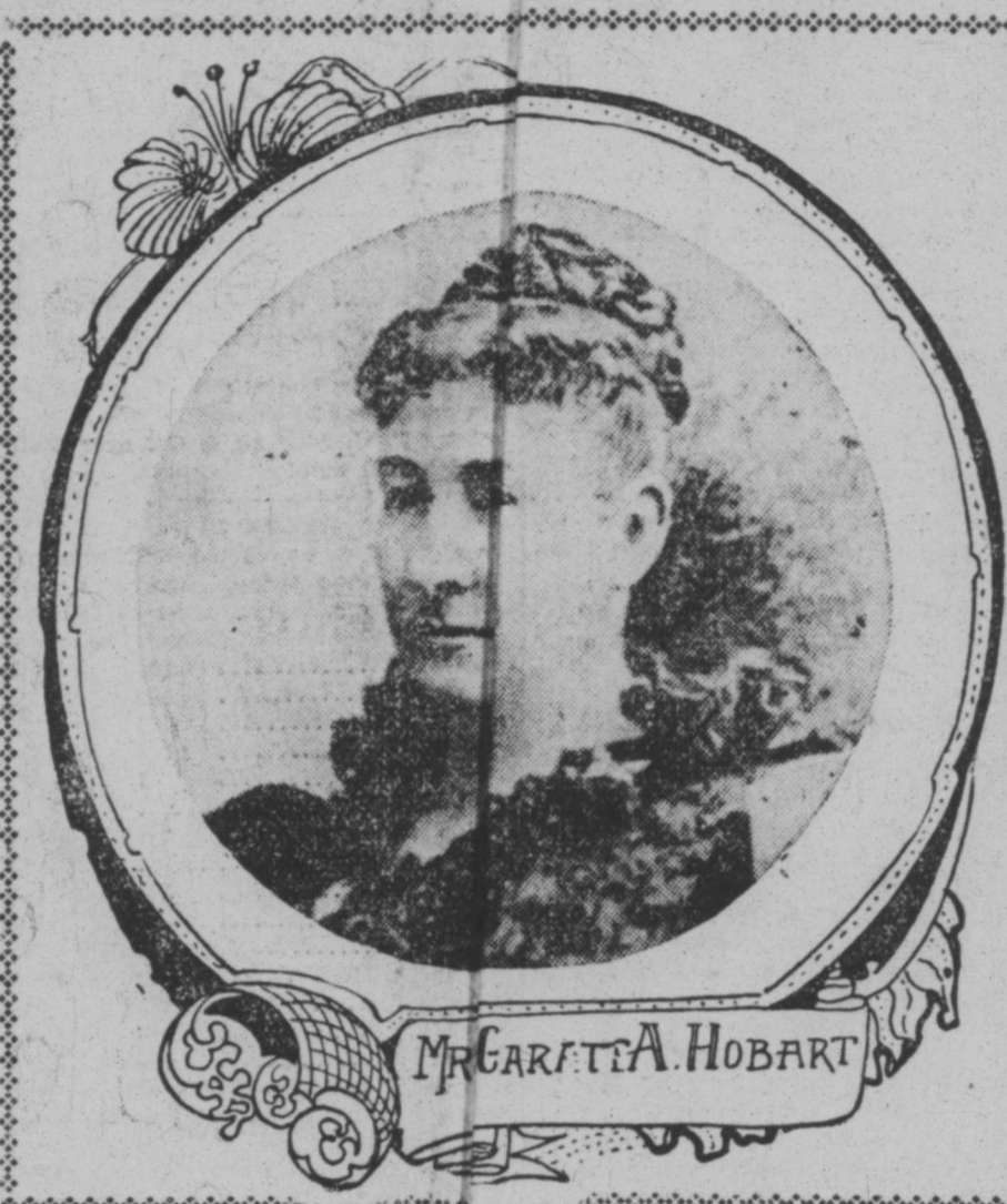
Mrs. Margaret A. Hobart, widow of the late vice president, is reported to be engaged to marry Senator William P. Frye of Maine.