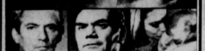
THE DIRECTOR: Overnight he can make or destroy a sex-goddess. THE STUDIO BOSS: He was known for his clean pictures and his dirty deals. THE STRANGE WOMAN: She rules the mansion where Lillah lives!

METRO GOLDWYN MAYER PRESENTS AN ASSOCIATES AND ALENCH COMPANY PRODUCTION "The LEGEND of LYLAH CLARE" KIM NOVAK · PETER FINCH · ERNEST BORGNINE