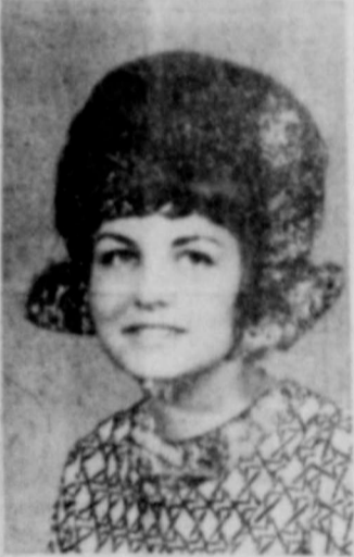
KAY WHITE Ford's Dry Cleaners, Eastland