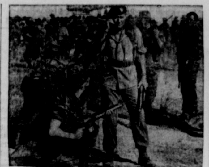
PHONE LANDING. John Wayne, as a Special Forces colonel, gives instructions to a helicopter for a South Vietnamese evacuation in "The Green Berets," now at the Majestic Theater through Tuesday.

Just Ask Long-Distance Operator For Enterprise 2326 And Your Call Will Automatically Be Placed Collect.