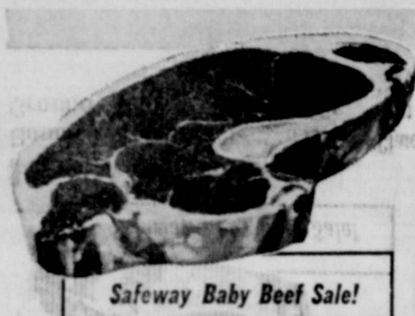
Safeway Baby Beef Sale!