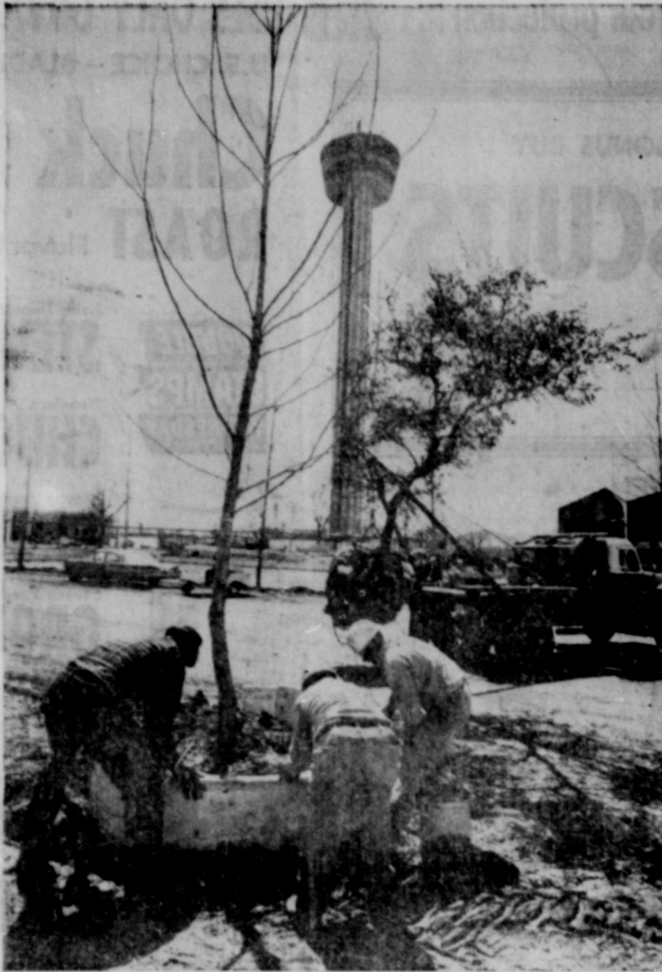
LANDSCAPING GOING IN —HemisFair workmen are planting trees and grass in preparation for the opening of the world's fair April 6. Workers above are putting the final touches on one tree planting while a truck stands ready to lower another in the continual preparation for the six-month international exposition.