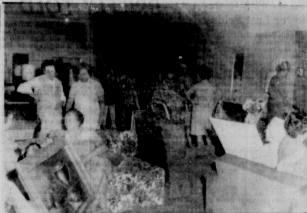
AREA ART LOVERS ARE SHOWN ABOVE who attended the Art Exhibit Saturday evening at the local Montgomery Ward Store. Several hundred attended the show which area artists displayed their work.