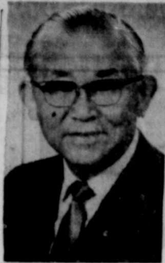
Tours International in Tokyo, also an advisor and former chairman and president of the board of the "Japan Times" in Tokyo.