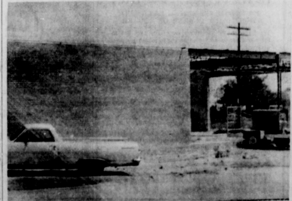
PROGRESS on the future home of the Commercial State Bank is shaping up nicely as workmen are putting the walls up on the building. Completion date is the early part of December.

The Commercial State Bank will host a reception at Lone Cedar Country Club between the hours of 7:30 and 9 p. m. Monday, Sept. 11. The occasion will honor all faculty members of Ranger Public Schools and Ranger Junior College, members of RISD Board of Trustees and Boards of Regents of RJC. Lists of faculty personnel includes names of approximately 20 new instructors and this informal affair will afford opportunity for all interested persons to meet and welcome them to our schools and to our town.